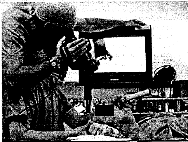
Figure 1: A laryngoscopy in progress. An anaesthetist is recording the frontal view of the vocal cords (shown in the TV monitor) while the other is using a laryngoscope to compress the tongue of the patient and measure the extent of the view of the vocal cords.

Laryngoscopy is a procedure, carried out by anaesthetists, in which the tongue of a patient is compressed and displaced to one side of the mouth using a rigid blade (Fig. 1). A tube is subsequently inserted into the larynx to feed a mixture of oxygen and anaesthetic gas to the lungs. Difficult intubation can cause mortality associated with anaesthesia, but yet the reasons for difficult laryngoscopy have not been completely identified or explained. Anaesthetists must be trained to respond rapidly and correctly to a wide variety of circumstances occurring during laryngoscopy, many of which are critical to the well being of the patient. Training in the use of the laryngoscope is currently carried out using plastic models of the head. These have a number of clear disadvantages. They are not realistic, they offer no variation, they do not attempt to simulate difficult airways, and there is no way of assessing the quality of the trainee. For example, there are not penalties for a trainee who uses excessive force. All of these limitations could be overcome by means of a computer simulation using virtual reality with appropriate haptic feedback.